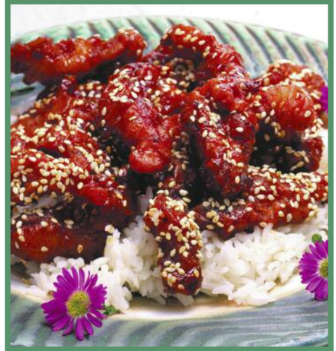
119 Sesame Chicken