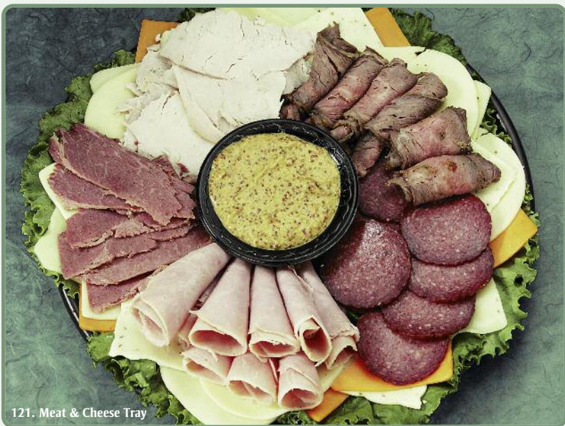
121. Meat & Cheese Tray

Minimum order is 8 .....$9.30 per person