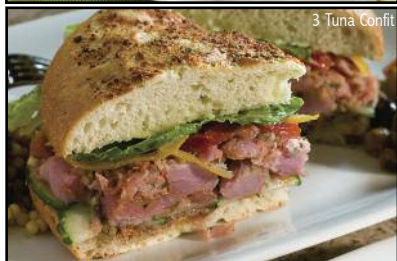
3 Tuna Confit