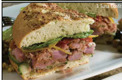
3 Tuna Confit