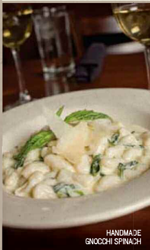
HANDMADE GNOCCHI SPINACH