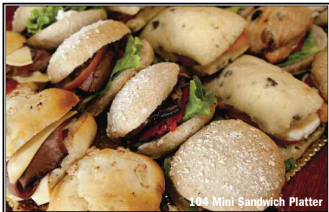
104 Mini Sandwich Platter

$19.50 per dozen ($1.62) Minimum of 1 Dozen