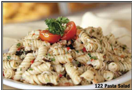
122 Pasta Salad