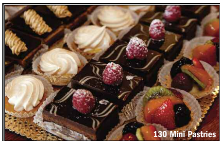
130 Mini Pastries