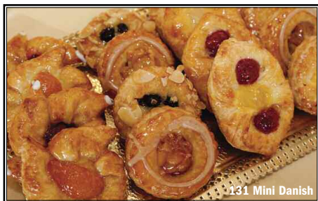
131 Mini Danish