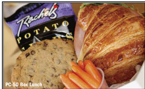
PC-50 Box Lunch

We require 24 hour notice for all orders