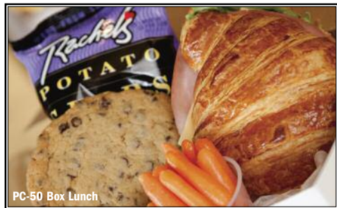
PC-50 Box Lunch

We require 24 hour notice for all orders