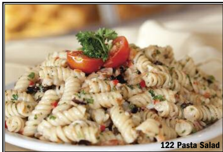
122 Pasta Salad