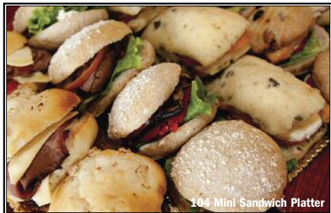
104 Mini Sandwich Platter

$17.75 per dozen ($1.47) Minimum of 1 Dozen