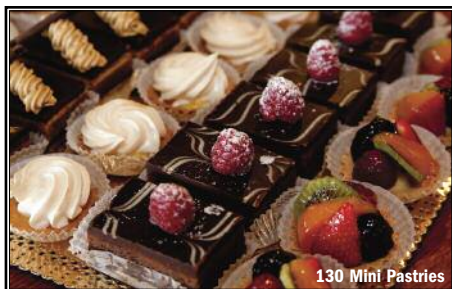
130 Mini Pastries