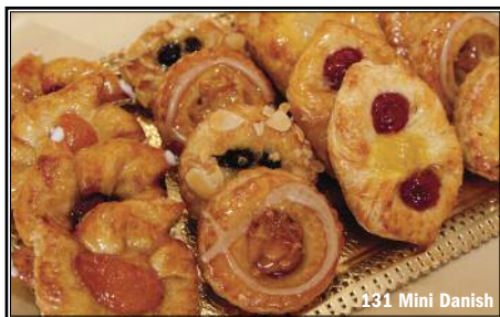
131 Mini Danish