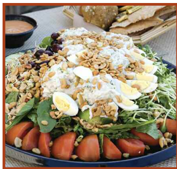
112 Cashew Chicken Salad