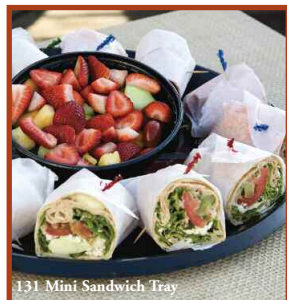
131 Mini Sandwich Tray