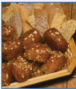
104 Bread Basket

An assortment of cookies and bars. serves 8-10 • $19.95 (1.99)