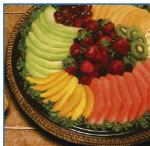
114 Fresh Fruit Plate

serves 4-6 • $44.95 (7.49) / serves 8-10 • $66.95 (6.69)